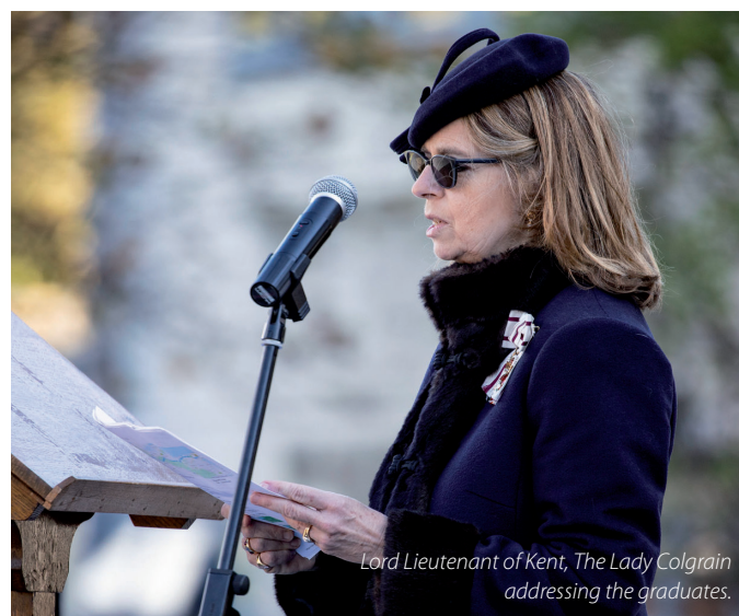
Lord Lieutenant of Kent, The Lady Colgrain addressing the graduates.