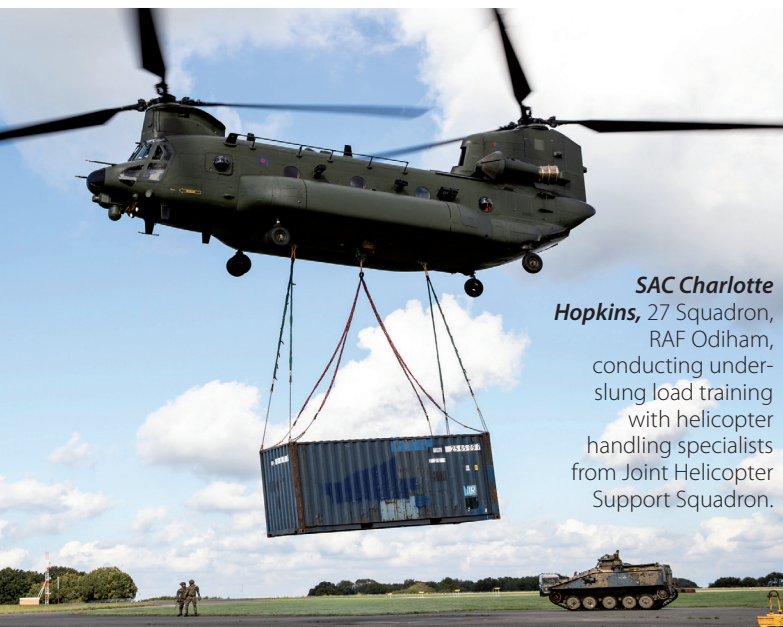
SAC Charlotte Hopkins , 27 Squadron, RAF Odiham, conducting under-slung load training with helicopter handling specialists from Joint Helicopter Support Squadron.