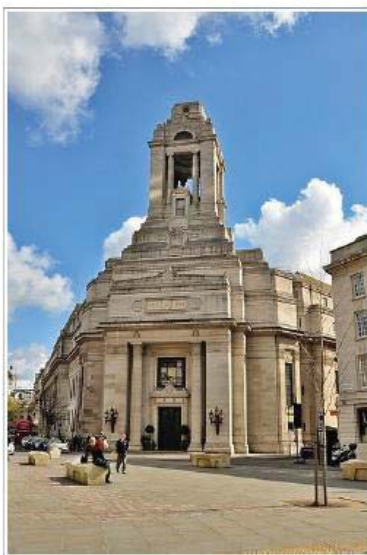
Freemason's Hall, Great Queen St, London