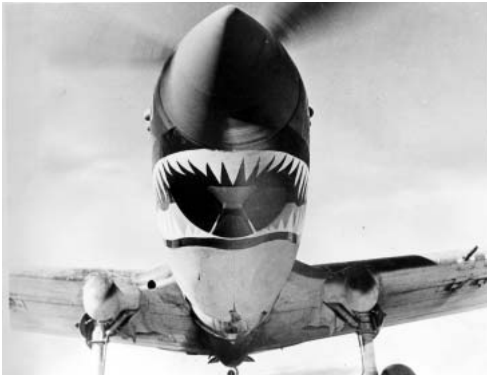
Teeth of the Desert Air Force — a Tomahawk of No 112 Squadron RAF, 1941.