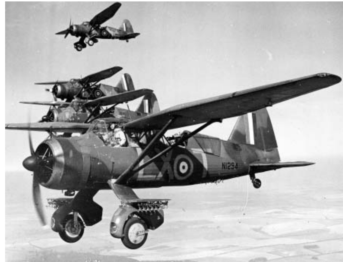
RAF air support in 1940: Lysander army co-operation aircraft of No 225 Squadron.

Defeat at the hands of the Wehrmacht convinced most soldiers that they had been right all along: the army required its own aircraft if it was to have any chance of success in a modern war. Furthermore, the War Office claimed that the army required its own specialised air forces, consisting of a fighter umbrella for defence and dive-bombers for close offensive support, sub-allotted to ground commanders at both corps and divisional levels. This, claimed the General Staff, was what the German Army enjoyed. 26 The Air Staff disagreed. Effective air support, responded the airmen, was dependent on a high degree of air superiority. To achieve this superiority demanded an air force superior in strength to the enemy air force opposite: a unified air force consisting of bombers, fighters, reconnaissance, communication and transportation aircraft