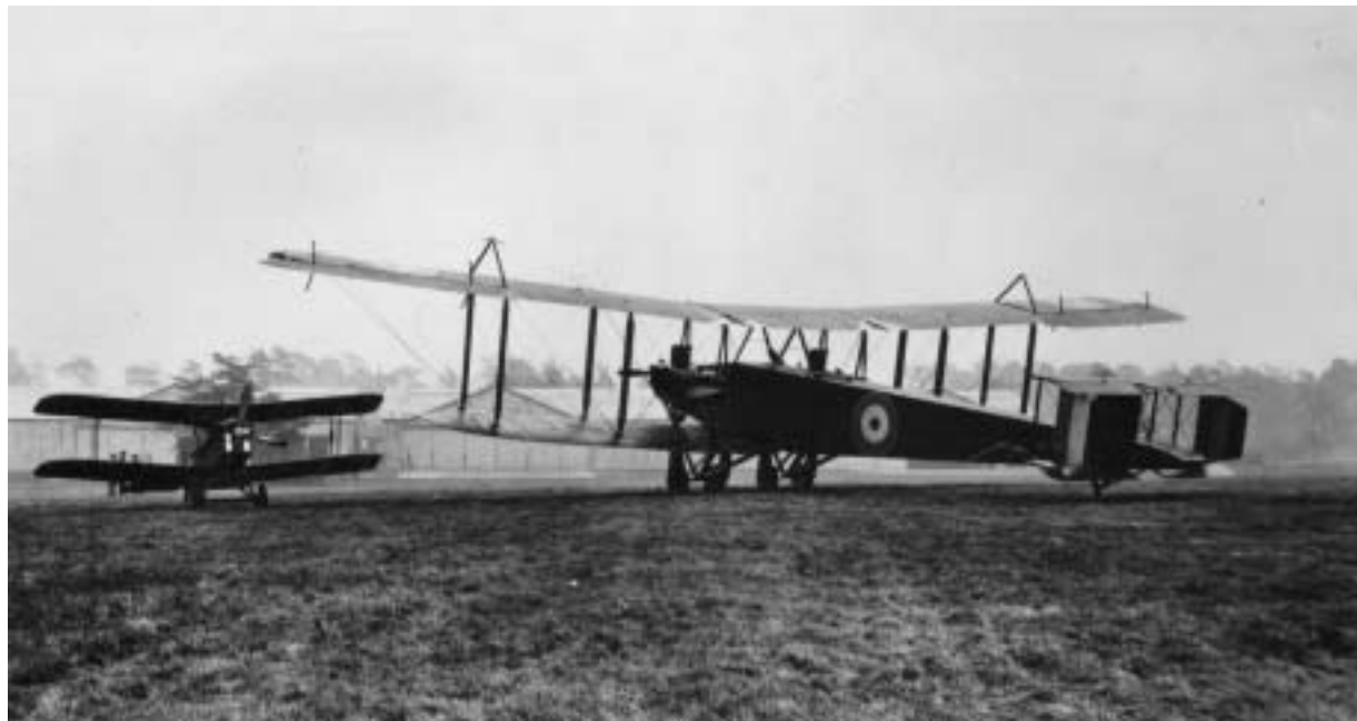
Britain's primary air superiority and long-range bombing aircraft at the end of the First World War: an SE 5a fighter is dwarfed by a Handley Page O/100 bomber, February 1918.