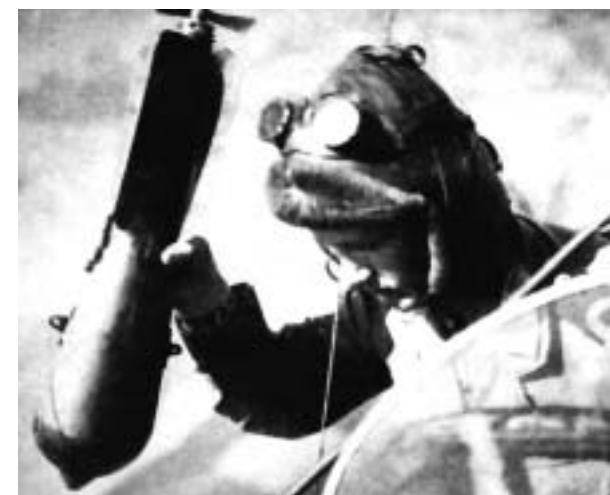
The primitive beginnings of ground attack.

Aircraft were used as 'flying artillery' to help the infantry advance. Army commanders, seeking the ultimate in close air support – to the exclusion of all other forms of combat aviation – employed as many aircraft as possible in a ground attack role at the forefront of their contact battle. 11