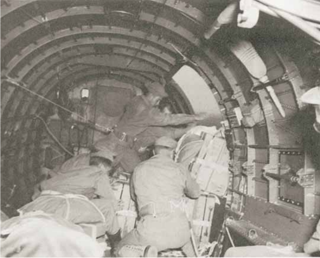
A Dakota drops supplies to ground troops

Concentrated around the Admin Box, they heroically repelled the Japanese onslaught in some of the bloodiest fighting of the war in Burma, while a steady stream of Dakotas sustained them with rations, weapons and ammunition