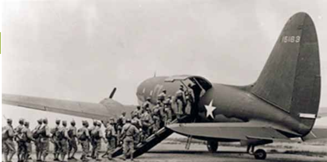
A C-46 Commando aircraft airlifts supplies and troops in to the battle-zone

By 1944, it was air power that gave the Allies a means of defeating the Japanese army, particularly (although by no means exclusively) through the systematic exploitation of airborne movement and logistics, and close air support