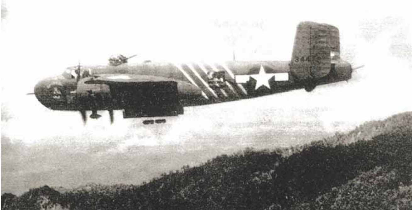
B-25H Mitchell of the first Air Commando Force, US Army Air Force, over Burma

The problem of co-ordination was exacerbated by the fact that the larger bombers were based hundreds of miles behind the battlefield