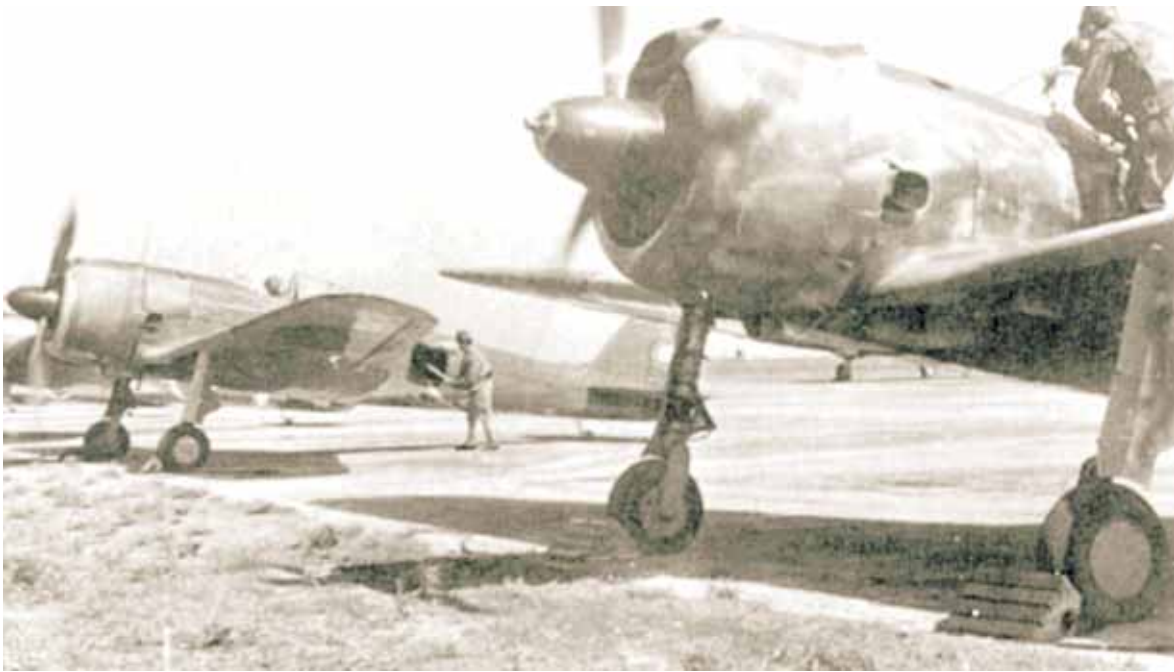
Japanese Ki-43 Oscar aircraft prepare for take-off

During the early stages of the war with Japan, Allied air forces in South-East Asia found themselves heavily outnumbered and outclassed by their adversaries