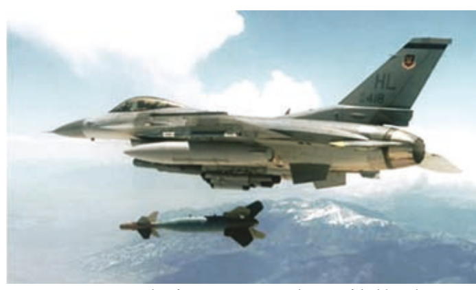
A USAF F-16 releasing a Paveway III laser-guided bomb

And therein lies the significant change, self-evident to anyone who has sat in an operations room in Afghanistan or Iraq, who has watched the change in balance between air and land over persistence and precision. A soldier cannot remain amongst a hostile populace for protracted periods, building an understanding of pattern of life, assessing movements of key individuals, understanding their habits and associations. Air can, and does6. The very presence of a military unit, heavily protected and moving to retain tactical surprise, changes that which is observed. Silent and invisible, air