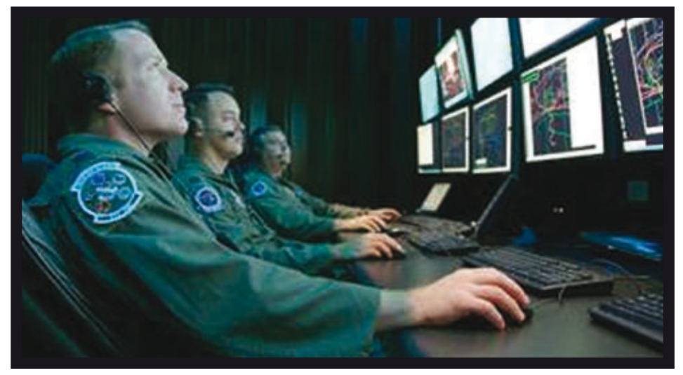
USAF personnel oversee electronic warfare mission data flight testing