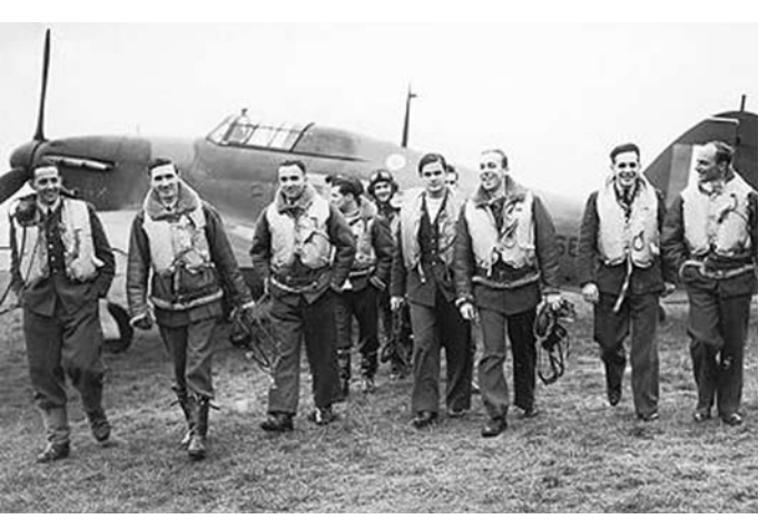
Pilots from 303 Squadron

Why at such a late date, after the fine performance of the Polish land and naval units in the Norwegian campaign, such a disgraceful agreement was signed by the Polish Prime Minister and Commander-in-Chief, remains a mystery.