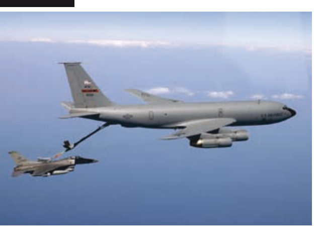
USAF KC-135 tanker refuels an F-16 Fighting Falcon over Iraq

At the same time, height has its limitations. The resolution of the area observed diminishes the higher the observer is situated, and some of man's senses becomes almost meaningless as tools for interpreting a situation. When a man or his camera are positioned 20,000 feet above the ground, one can neither smell nor feel the things observed.