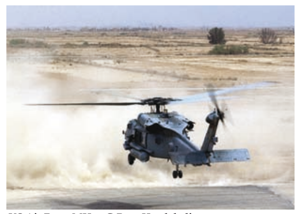
US Air Force MH-60G Pave Hawk helicopter takes off from Tallil Air Base, Iraq

A lot of the technology within communications and information equipment is developed to let the operator decide on options more easily and quickly than before. This technological development tries