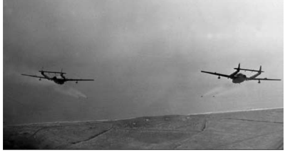
RAF Venoms attacking rebel forces

Nizwa was captured the next day, allowing the two columns to link up at Birkat al Mawz. Unfortunately, the