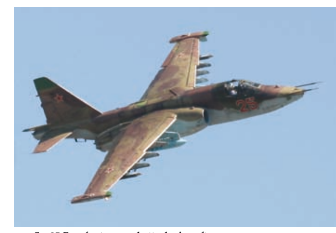
Su-25 Frogfoot ground attack aircraft

The test of any putative capability should indeed be relevance to current operations and what we can predict of future conflicts. It must, however, be acknowledged that our predictions of future conflicts and strategic events have been consistently inaccurate. Thus, our best safeguard is flexible capability, systems that can adapt, with geographical and operational reach, yet capable of operating with intimacy. Our capability must not be contingent on the interests of our defence manufacturers, or the internecine struggles that distort the historical record and pervert departmental policy. We must acknowledge, with clarity and impartiality, what it is that delivers the necessary effect now and has the adaptability and growth potential to meet the uncertain demands of the future. Global reach and ubiquity have long been essential elements of air, but as technology accelerates, airpower is entering an era of unparalleled adaptability, persistence and precision. It is at