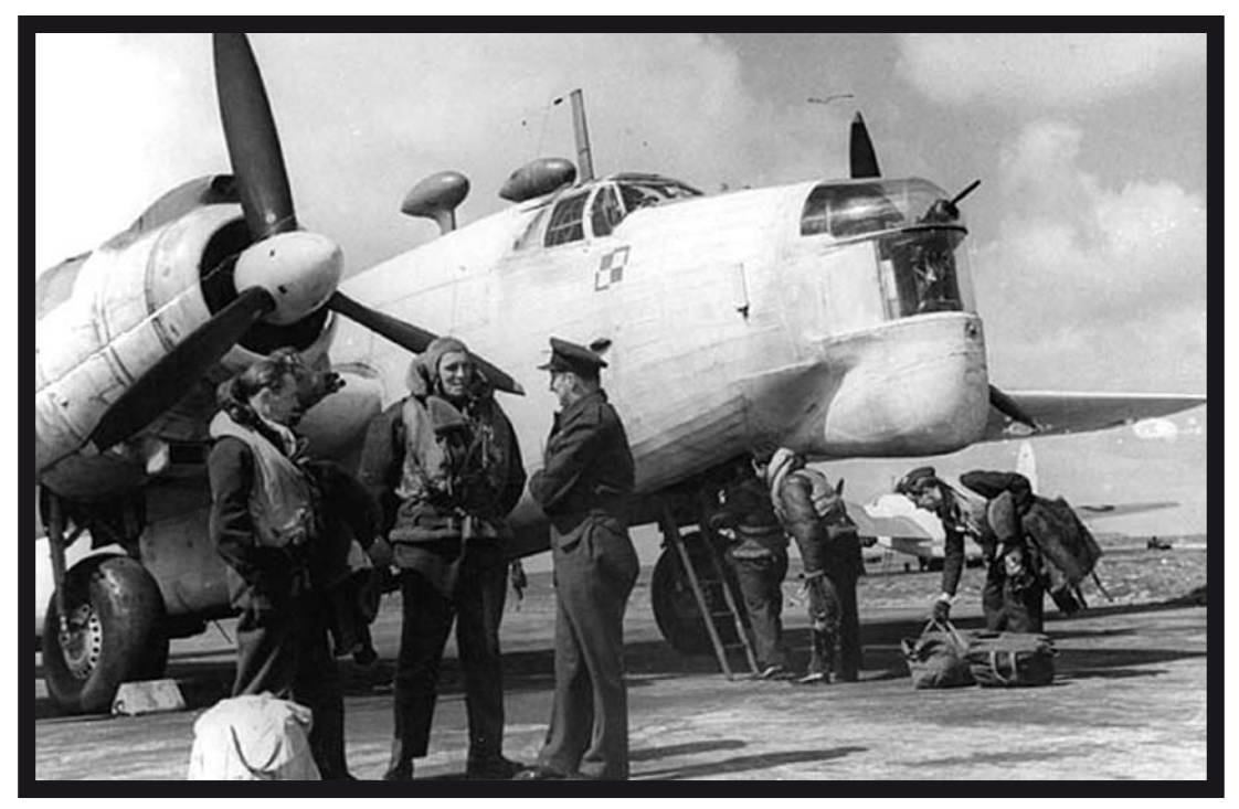
Polish aircrew serving with 304 Squadron with their Wellington maritime patrol aircraft