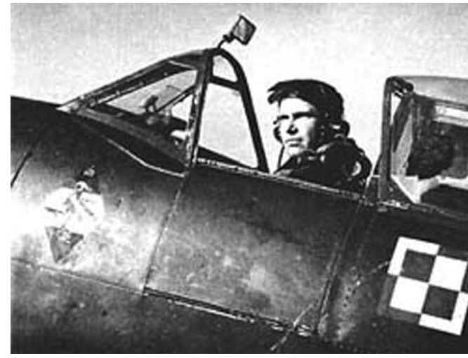
302 Squadron Spitfire

But everything changed with the French capitulation and the evacuation of the remnants of the only recently formed Polish Army to Britain. This included the 5,000 Polish airmen who had not originally been selected for transfer to Britain who now found themselves in the United Kingdom. The British referred to them as the "French Poles" as opposed to the "British Poles". Regardless, they were all now in Britain