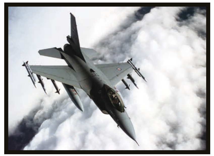
A Royal Norweign Air Force F-16 over the Balkans