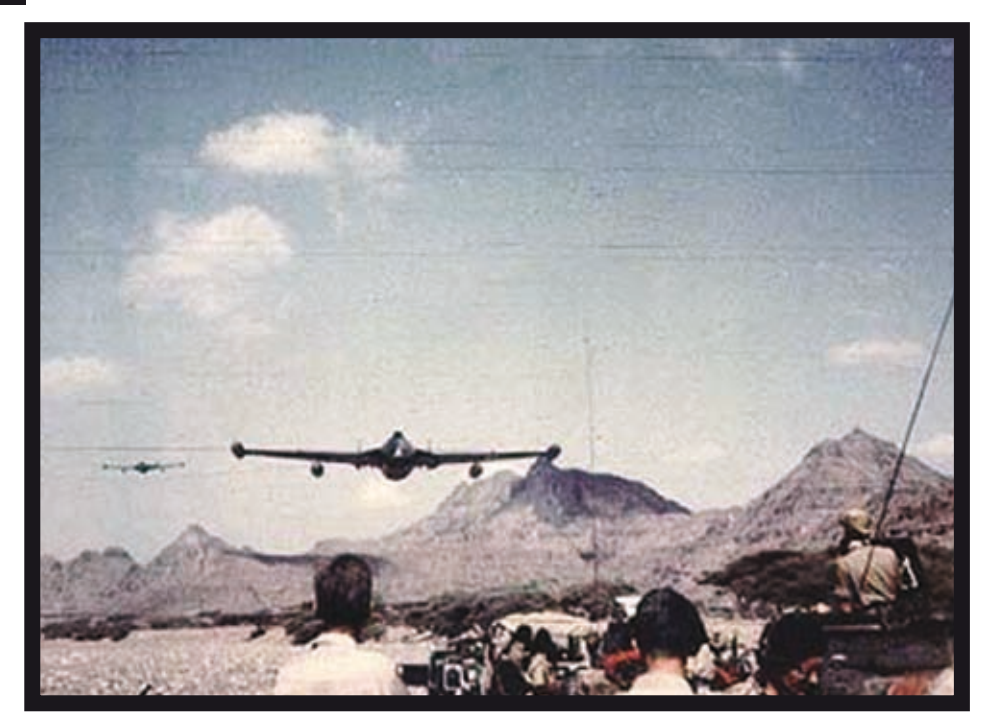
RAF Venoms were used to destroy rebel strong points using their considerable fire power