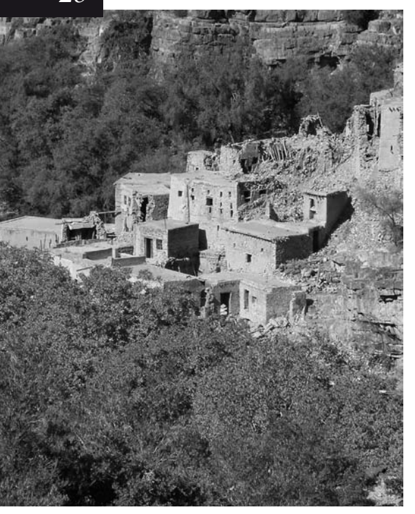
The ruined village of Wadi Bani Habib, a 'rebel stronghold' of the Jebel Akhdar War

forces to concentrate insurgents before air operations could be of use'.33