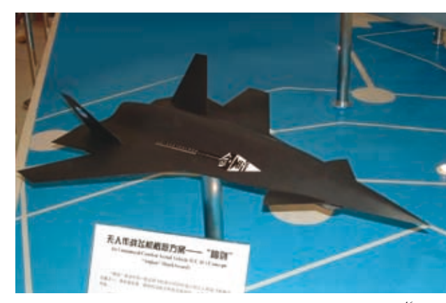
Fig 3 Concept Chinese UCAV - 'Anjian' (Dark Sword)<sup>46</sup>

of both, particularly the Harpy UCAV from Israel, has expanded China's options for long-range reconnaissance and strike.<sup>45</sup>