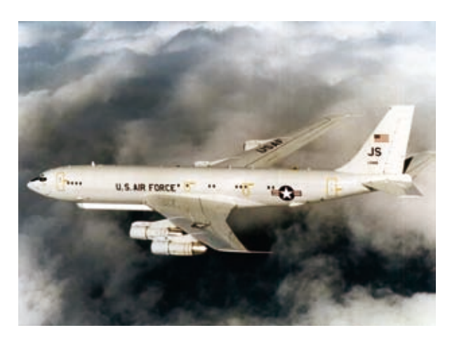
The E-8C Joint Surveillance Target Attack Radar System (Joint STARS) is the only airborne platform in operation that can maintain real time surveillance over a corps-sized area of the battlefield. A joint Air Force - Army program, the Joint STARS, uses a multi-mode side looking radar to detect, track, and classify moving ground vehicles in all conditions deep behind enemy lines

well the change of 'boss' actually went. Suddenly, as a Tactical Control Officer of the HAWK system, I was being led by an American whom I had never met. And we performed quite well.