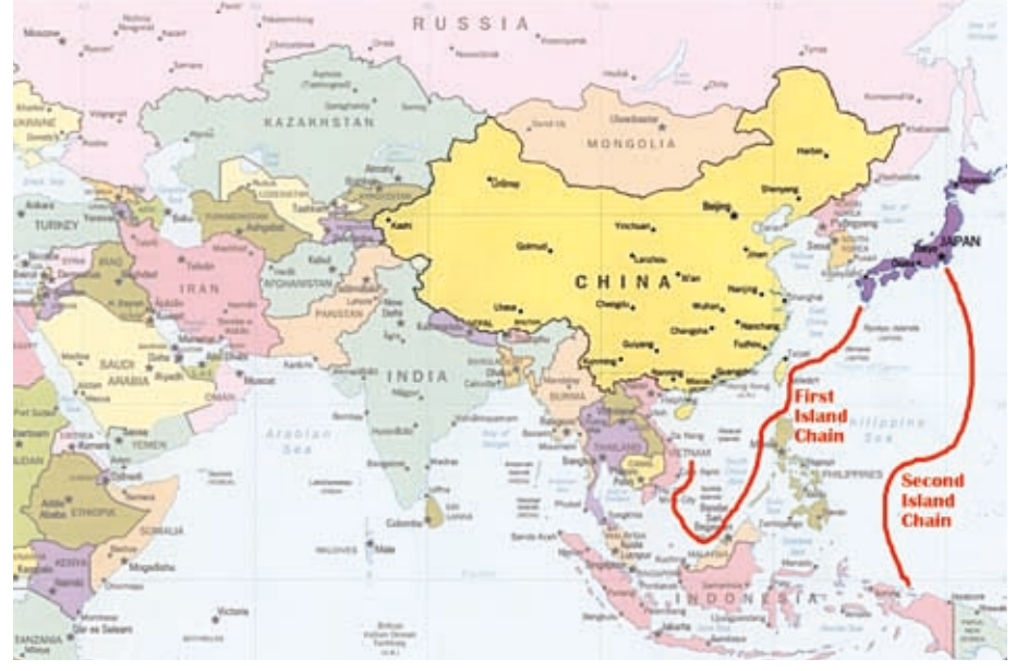
Fig.4 The First and Second Island Chains 106

any Taiwan conflict, if, for example, the country is struck as part of any Chinese Joint Anti-Air Raid Campaign. Based on offensive and defensive counter-air operations, these operations extend beyond the defence of Chinese airspace to include strikes (by aircraft or missiles) against an adversaries bases (including aircraft carriers) and logistics, to degrade the adversary's ability to conduct air operations.<sup>105</sup> Chinese anti-access strategies aimed at preventing U.S. interference in any Taiwan campaign could also involve projecting naval and air power out to the Second Island Chain (with the SU-30 armed with anti-ship missiles for example), which would take them right up to Japan.