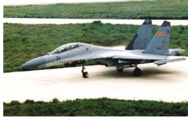
Fig 1 The J-11 China's first modern multi-role fighter<sup>17</sup>

'The PLA is pursuing comprehensive transformation from a mass army designed for protracted wars on its territory to one capable of fighting and winning short-duration, high-intensity conflicts against high-tech adversaries — which China refers to as 'local wars under conditions of informationization.'8