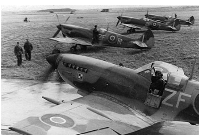
Spitfire XVIs of 308 Squadron

legally responsible for its air personnel which fought in the West.