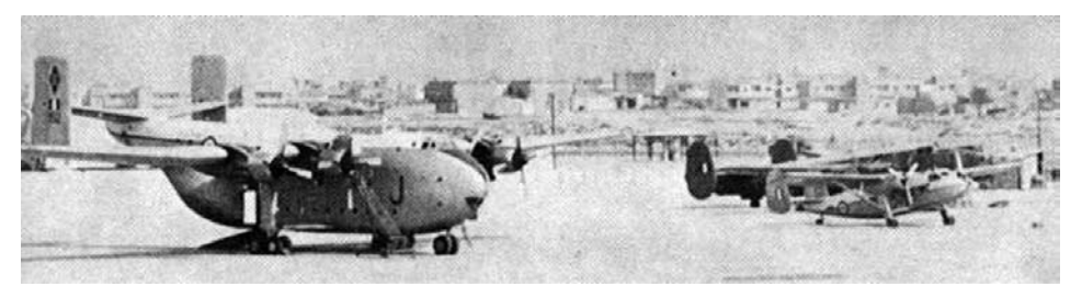
RAF Station Sharjah was one of the most important British assets in the Middle East during the 1950s. Seen here on the ramp (from left to right) are a Beverley of No 30 Squadron, a Twin Pioneer of No 152 Squadron and a Shackleton of No 37 Squadron

forced to withdraw under constant attack, suffering heavy casualties and losing most of their vehicles in the process. Nizwa itself fell to the rebels on 17 July.