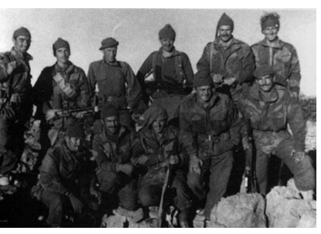
SAS troops after securing Jebel Akhdar

It was argued that the only solution lay in a full scale military operation. Options included a parachute descent on the plateau or a helicopter-borne