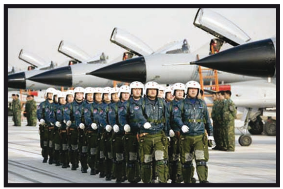
Chinese pilots parade in front of their J-10 fighters