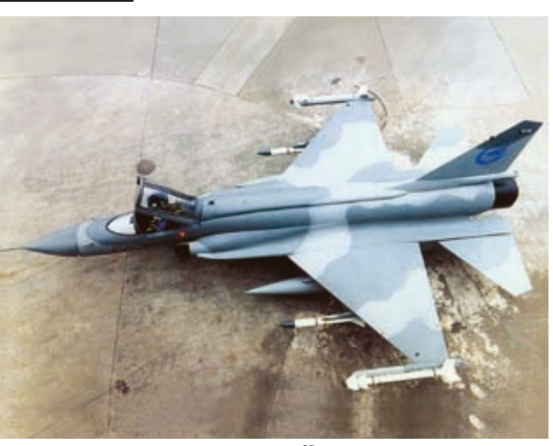
Fig 2 FC-1 multi-role fighter<sup>25</sup>

and more importantly an airborne warning and control aircraft (AWAC).29 This lack of an AWAC capability is one of the major problems facing the PLA.<sup>30</sup> In the late 1990's, China attempted to purchase 4 highly capable Phalcon AWAC aircraft from Israel, in an effort to rectivy this problem, but this deal collapsed in 2000 after heavy political pressure from the U.S.31 China has subsequently tried to develop its own AWAC system, the KJ-2000, based on the Russian A-50 platform. However, this programme suffered a major setback when one of the two development aircraft crashed in June 2006.32 As work continues on this programme, it is possible that four aircraft have now had fixed AWACs radomes fitted. At the same time, efforts have been ongoing to configure the Y-8 medium transport aircraft into an AWAC platform along similar lines to the Swedish active phased-array Erieye system.33 When fully operational, these systems will substantially increase the PLA's ability to conduct aerial surveillance and co-ordinate and direct offensive and defensive air and naval operations.34