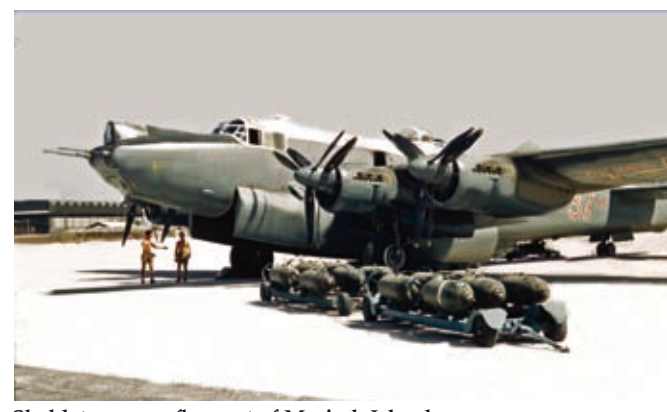
Shakletons now flew out of Masirah Island, some 175 miles to the south of Jebel Akhdar

The first attempt to dislodge the rebels took place on 25 September when the